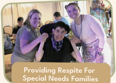
Providing Respite For Special Needs Families