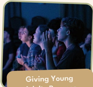
Giving Young Adults Purpose