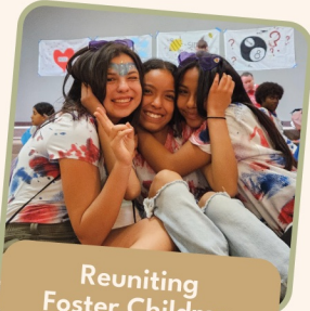
Reuniting Foster Children