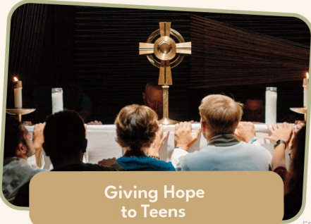
Giving Hope to Teens