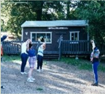
The early Angels in the Winds shop