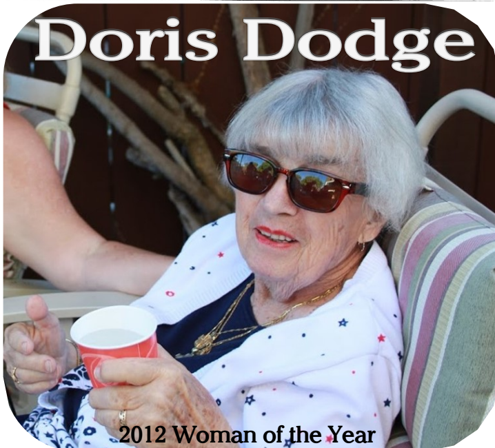
2012 Woman of the Year