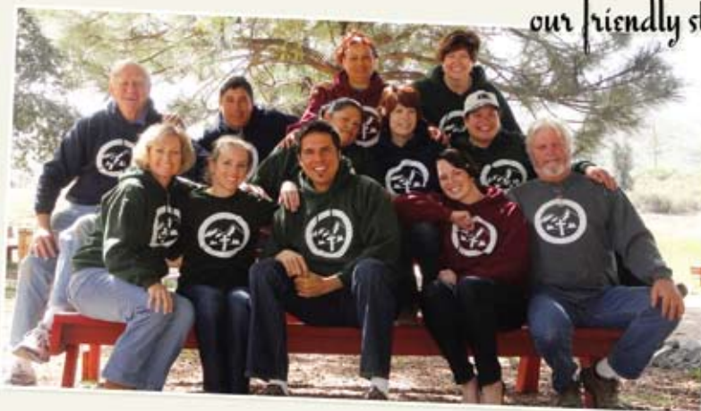
our friendly staff

At the 28th Annual Dinner Dance Gala in April, 377 guests attended the festive evening which raised $43,700 for the Founders Hall and Prayer Chapel building project, specifically for furniture, fixtures, and equipment.