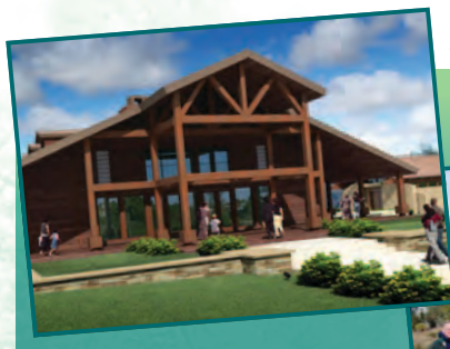
Founders Hall Ground Breaking