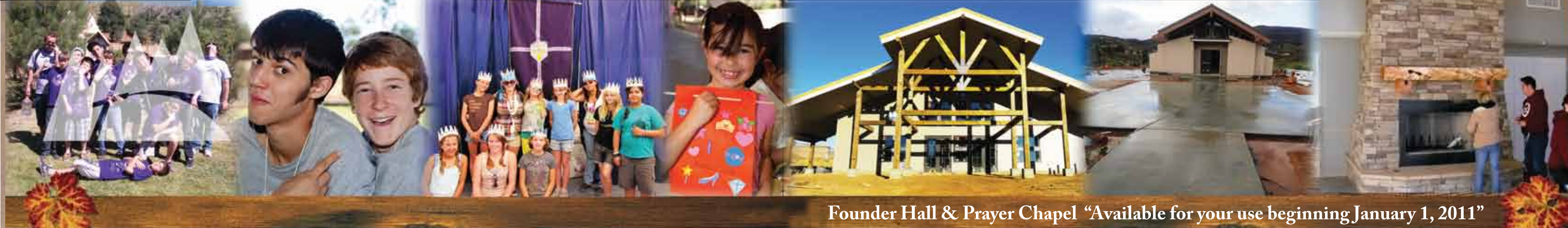
Founder Hall & Prayer Chapel "Available for your use beginning January 1, 2011"