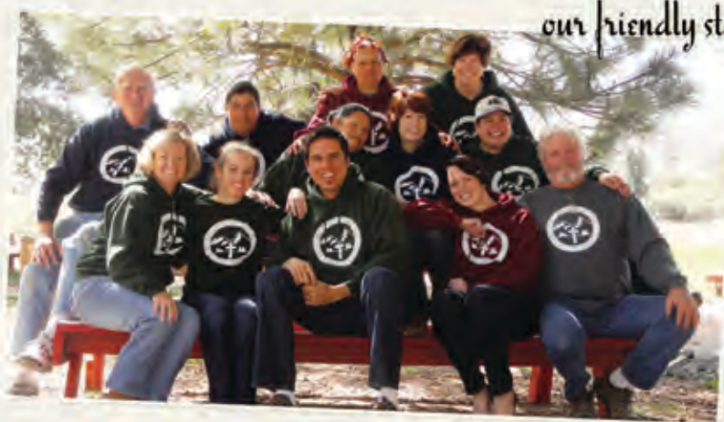
our friendly staff

At the 28th Annual Dinner Dance Gala in April, 377 guests attended the festive evening which raised $43,700 for the Founders Hall and Prayer Chapel building project, specifically for furniture, fixtures, and equipment.